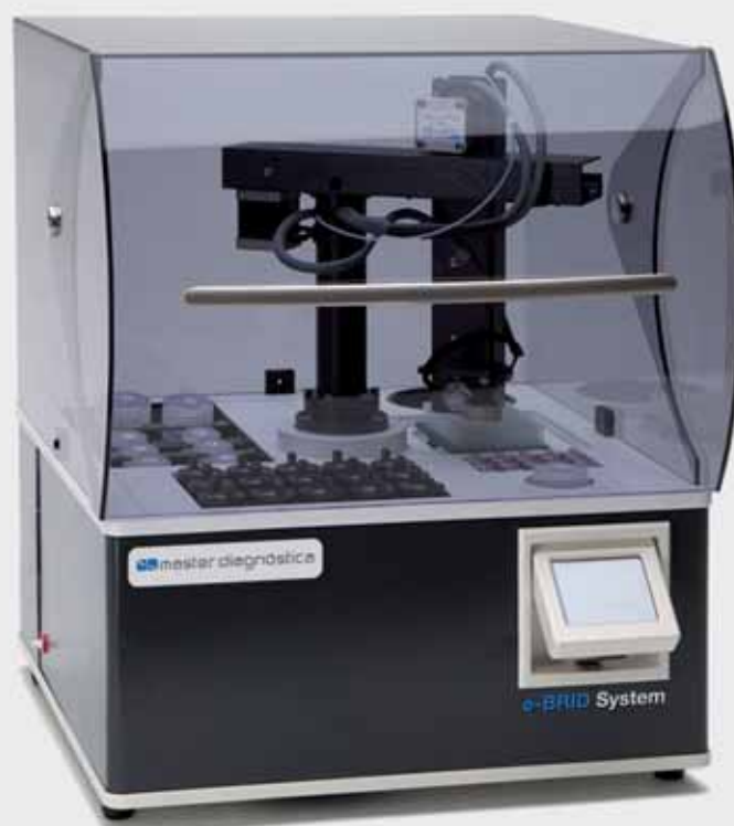
Engineered and manufactured by Hospitex Diagnostics